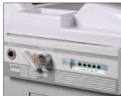
Simplex Pushbutton With Key Lock Override