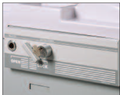
Tamper Resistant Best® Key Locking System