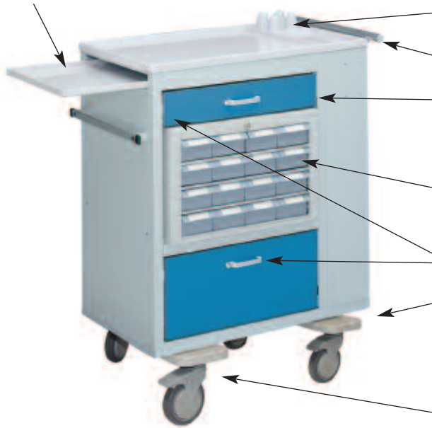
Pull-out shelf DMC3-4S10

Both sides of cart have same drawer configuration.